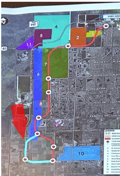
NATURAL and PHYSICAL FEATU

The mailer's message meshed with Gimenez's dismissal of Garcia's comments about an expanded expressway boosting car trips, rather than just redirecting them. But research touted by urban planners does knock highway expansion as a temporary fix that often simply encourages more people to drive until congestion returns.