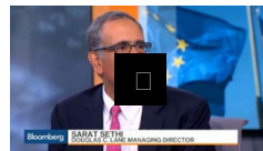
How to Trade Markets During Greece Crisis