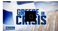
Greece's Varoufakis to Quit if Cuts OK'd